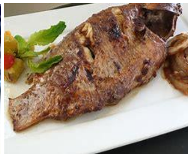
WHOLE FRIED TILAPIA