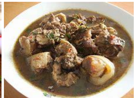
BEEF PEPPER SOUP