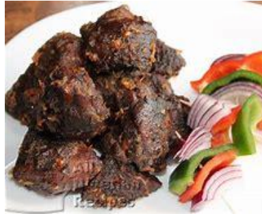
FRIED GOAT MEAT