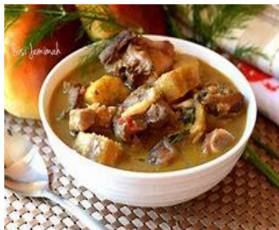
GOAT PEPPER SOUP