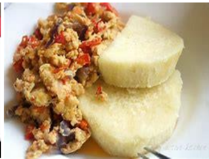
YAM AND EGGS