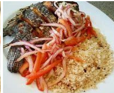
ATTIEKE WITH FISH