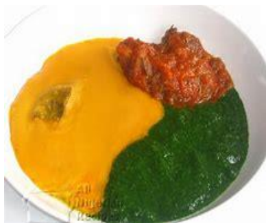
GBEGIRI AND EWEDU