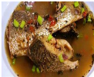
FISH PEPPER SOUP