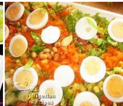
SALAD (NIGERIAN STYLE)